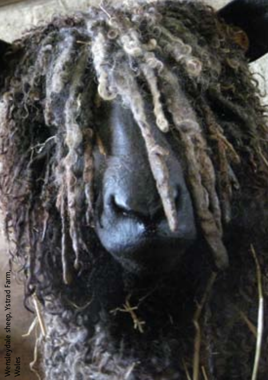
Wendleleydale sheep, Ystrad Farm, Wales

The Soil Association was founded in 1946 as a charity concerned with researching and promoting agricultural, environmental and human health. Today the Soil Association is a membership charity and NGO, working alongside its subsidiary, Soil Association Certification Ltd, which since 1973 has been certifying organic farms and businesses.