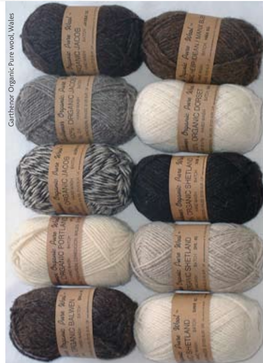
Garthenor Organic Pure wool, Wales