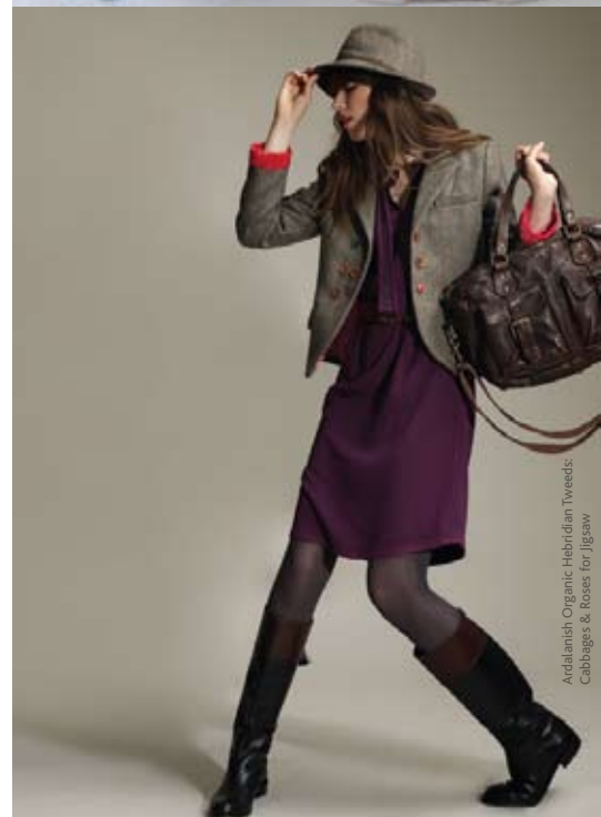
Ardalinish Organic-Hybridian Tweeds, Cabbages & Roses for Jigsaw